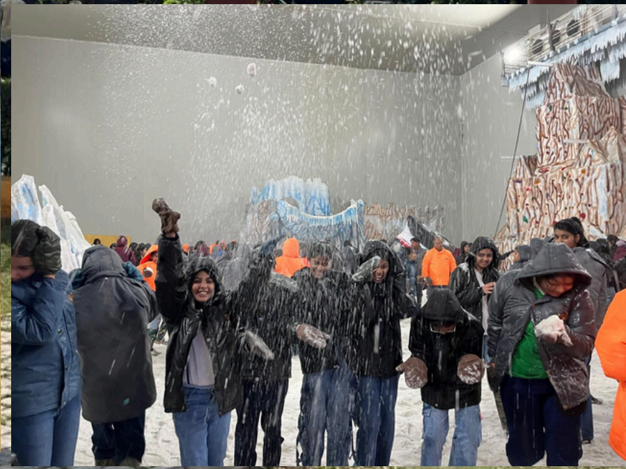
Memorable Mojoland Moments