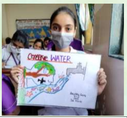
X: Poster Making