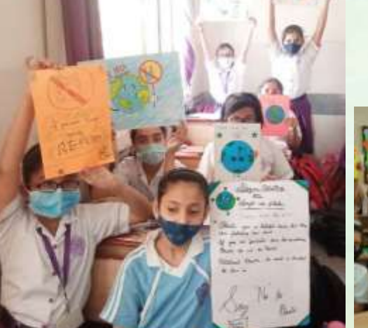
VI: Slogan Writing on ways to protect our planet