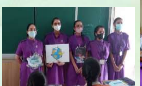
IX: Clay Modelling depicting various threats to our Environment.