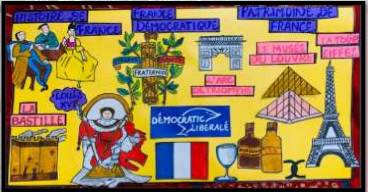
CLASS IX & X: 'Creation d'affiches'

- Poster Making on the literature & the culture aspect of France.