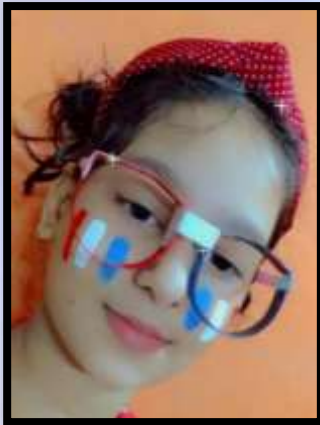
CLASS VI: 'Coin de Selfie' - Creating sunglasses using flag colours of France.