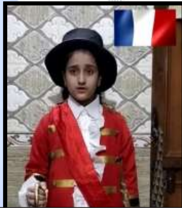
CLASS VII: 'Defile de mode' - Dressing up as a famous personality from the French literature.