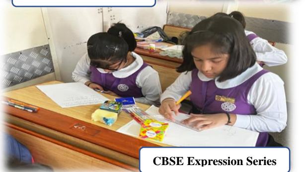
CBSE Expression Series