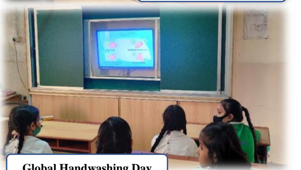
Global Handwashing Day