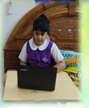
Digital Courtroom Drama