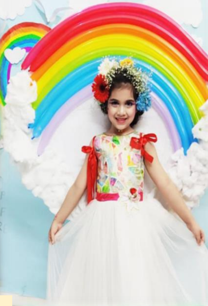
Rainbow, A Masterpiece of Nature