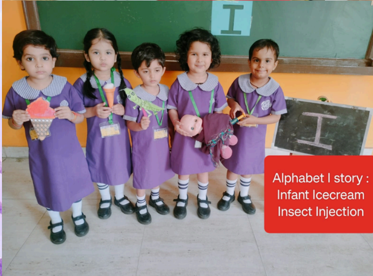
Alphabet I story : Infant Icecream Insect Injection