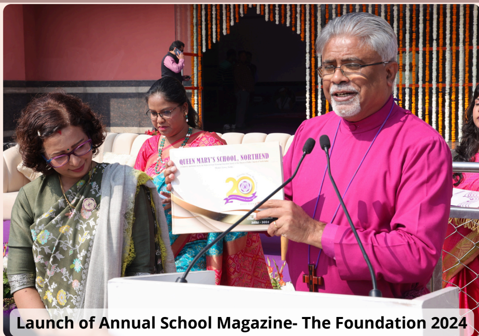
Launch of Annual School Magazine- The Foundation 2024