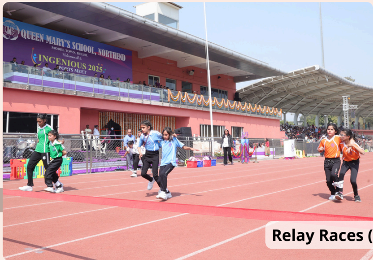
Relay Races (Class 5 to 11)