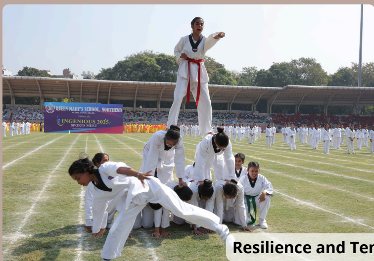
Resilience and Tenacity (Class 6)