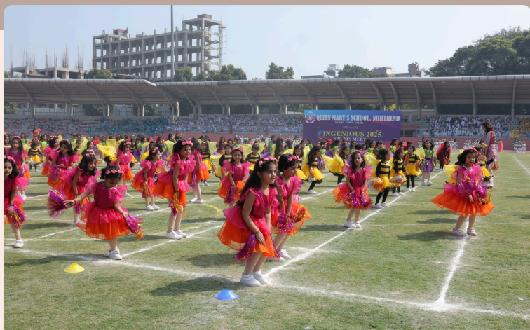
Magnum Opus (Kindergarten)