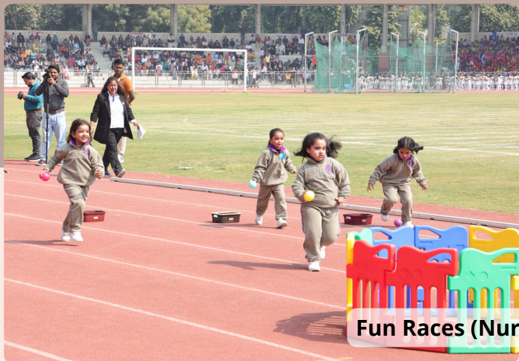
Fun Races (Nursery to Class 4)