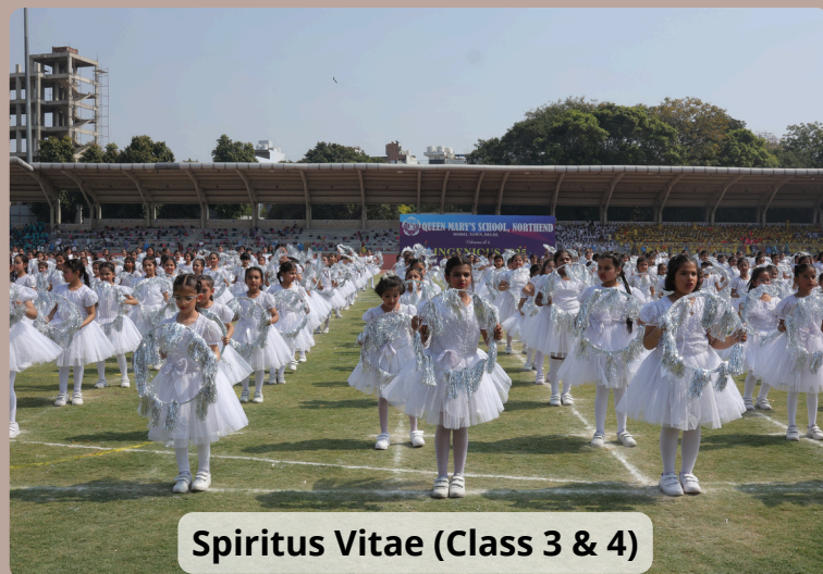
Spiritus Vitae (Class 3 & 4)